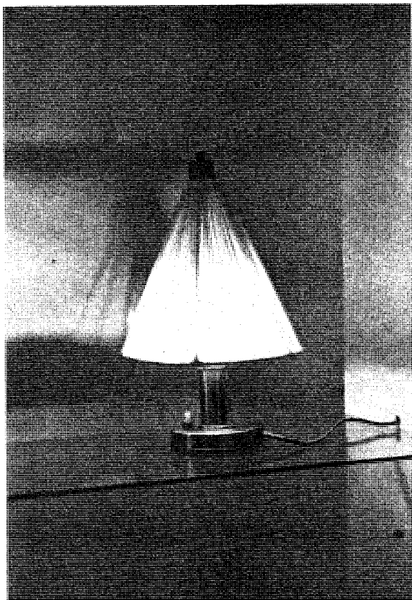
UMBRELLA LAMP, Willem Hendrik Gispen, ca. 1930

In addition, a visit to the Museum Fodor showed me that this showcase for Amsterdam artists indicated that a great many Amsterdam artists are foreigners. Videotapes were being shown by Italian, American, English, Columbian and other foreign artists. The Fodor is a showcase for art made by Amsterdam artists, and this video show was fascinating.