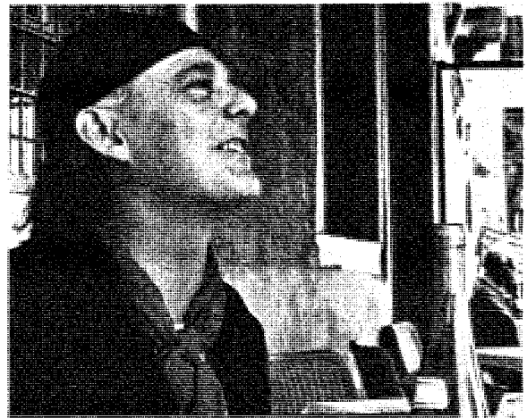
Above, JAMES LEE BYARS

Hated to leave the luncheon scene, but onward to the Magazzini del Sale, where we saw the young Italians, Germans, and Americans, hinting at what the 80s might hold. The space is beautiful, and the art was far more stimulating and indicative of the decorative, expressionistic