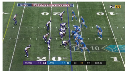
Traditional game camera angle