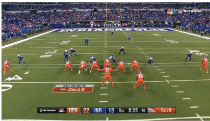
Madden camera angle