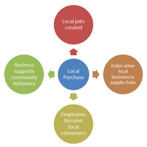
FIGURE 1. Multiplier effect in local purchasing.

Crafting the Policy with community-defined outcomes allowed York University to approach policy language and development in a different way: policy development could instead investigate how university activity might satisfy these longitudinal and, indeed, generational goals that the community identified. The policy development, therefore, was framed as a response to the policy's outcomes already affirmed by key community partners who would largely be the benefactors of York University's social procurement work. To craft the language of the policy, York University considered how its activities could contribute towards the impact the community working group sought to achieve.