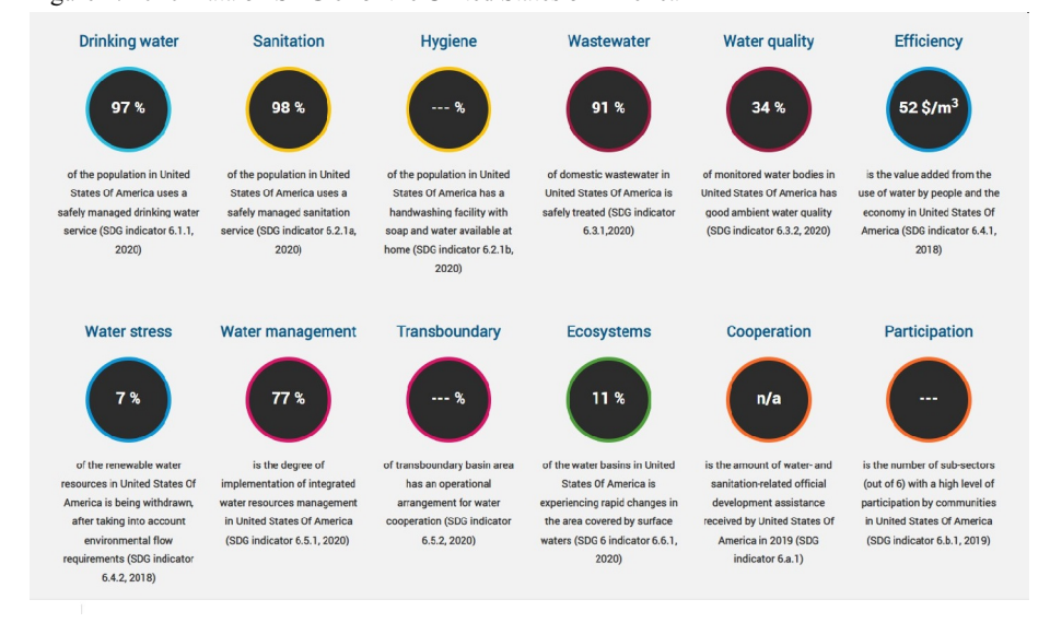
Figure 2: 2020 Data on SDG 6 for the United States of America<sup>162</sup>

At the same time, the UN, through UN Water, also compiled official data from WHO and UNICEF. <sup>161</sup> Figure 2 shows the snapshot for the USA data.