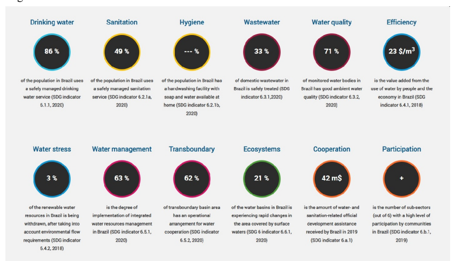
Figure 1: 2020 Data on SDG 6 for Brazil<sup>100</sup>

Because the first report on the state of Brazil's water was initially published in 2009, the data on certain SDGs dates back to 2009.<sup>101</sup> For example, target 6.1 shows that in 2009, seventy-nine percent of the population had safely managed to drink water service.<sup>102</sup> As seen in Figure 1, by 2020, Brazil had reached eighty-