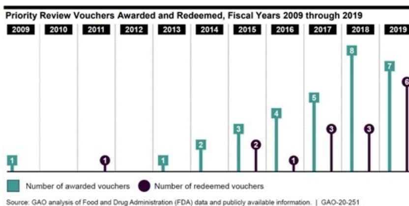
Figure 2 113

Futility risks ultimately counsel against PRV expansion. From the 2009 inception of the PRV program through 2019, thirty-one PRVs had been issued—seventeen have been sold, and sixteen have been redeemed (some PRVs have been both sold and redeemed, hence the combined amount sold and redeemed exceeds the total number of PRVs issued). 112 For an illustration of PRV issuances and redemptions, see Figure 2 .