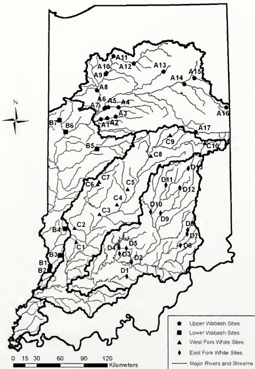
Figure 1.—Map of the Wabash River Watershed in Indiana, showing collection sites sampled in 2004.

topsyche spp., occurred at 72% of all sites (Table 2). Although Hellenthal et al. (2003) reported 11 Cheumatopsyche species for Indiana, the larvae of this genus currently cannot be identified to species level. Sampling and identification of adult material using larval-rearing, emergence traps, black-lights or