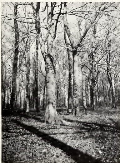
Fig. 2. Some of the few beech present in forest T, Sullivan County. (All photographs by Dr. J. E. Potzger, Jan. 31, 1938.)

Topography where the forests on the western lobe are located is similar to that of the eastern lobe with the exception of forest R, which has rather good surface drainage, and X, which has excellent surface drainage.