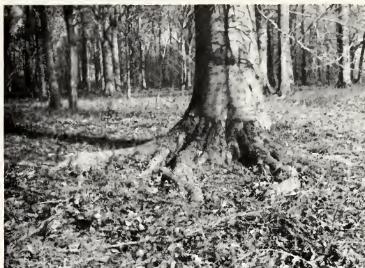
Fig. 4. Showing exposure of beech roots in forest T, Sullivan County.

the three-inch level, and 4.5 to 5.2 for the twelve-inch level. Braun (1936) reported practically the same acidity range for the soil in similar areas in Ohio.