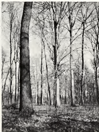
Fig. 3. Open park-like area in Forest T, Sullivan County. Pasturing has reduced the number of young stems.