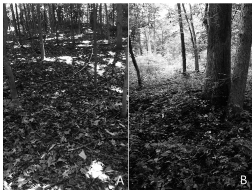
Figure 2.—Typical plot structure of Thomas (A) and Wysong (B). Note the relatively open understory in the former as compared to the latter. Both forests are on former agricultural land (pastures) within a half-mile of each other.

10 iterations set to 0.00001). R was used to run stepwise multiple linear regressions (functions ‘lm’ and ‘step’) to better describe which of the numerous plot level variables most influenced the richness and abundance of non-native species in the plots. R was also used to generate one-way ANOVAs (function ‘aov’) to compare means for biotic and environmental variables between the three woodlots ( \alpha < 0.05 ), with Tukey’s pairwise test used post-hoc to identify significantly different forests.