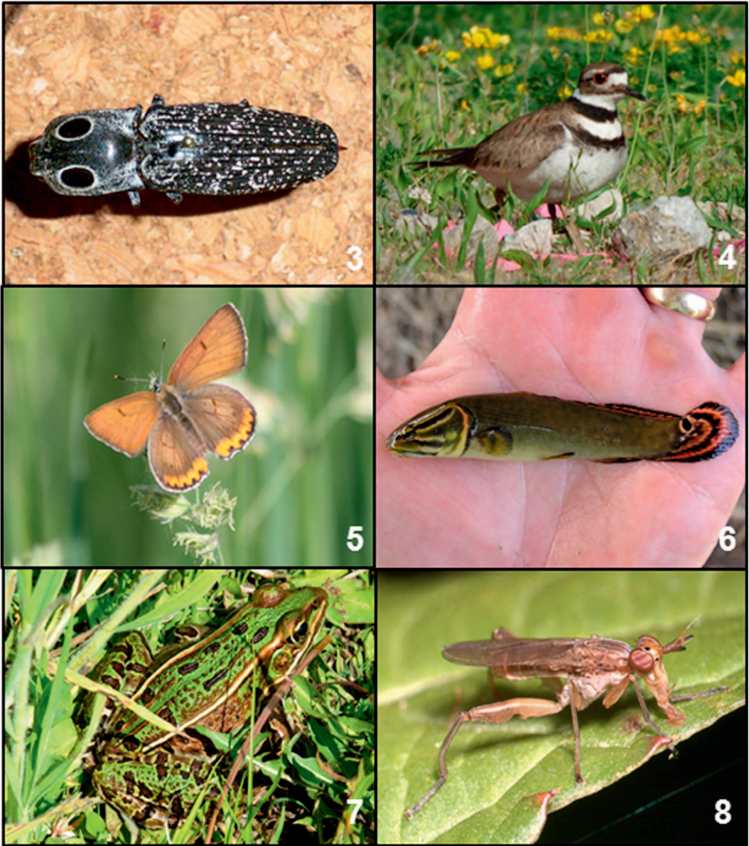
Figures 3–8.—Images of various organisms observed during the Eagle Marsh biodiversity survey. 3. Alaus oculatus , the eyed elater, a large and charismatic species of click beetle. 4. A Killdeer, Charadrius vociferous , at its nest. 5. A male Bronze Copper, Lycaena hyllus , butterfly. 6. A Bowfin ( Amia calva ). 7. A Northern Leopard Frog, Lithobates pipiens , a species of special concern in Indiana; it was very abundant and found in most habitats across the property. 8. A male Sepedon armipes , it was the most abundant sciomyzid (snail-killing fly) collected during the bioblitz. It’s one of the easiest sciomyzids to identify – the male has a deep notch and some peg-like protuberances on the hind femur. The fly is about 5 mm long.