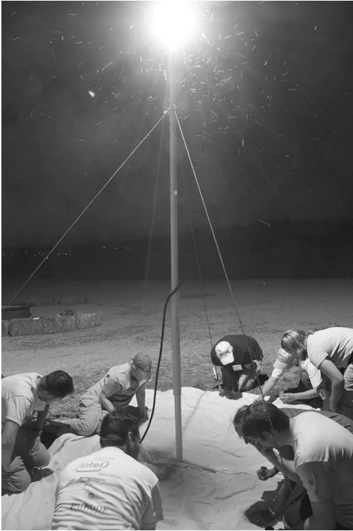
Figure 2.—Midnight collecting by the beetle team — beetles are attracted to a 1000 W metal halide light during the Eagle Marsh BioBlitz.

ground surrounded by marsh. Thus, collections were made on a small patch of dry ground, while the more abundant aquatic beetles were dominated by a few species. The wooded areas did contain a rich diversity of longicorn beetles and bark beetles for a rapid survey, although these mostly came from the traps left for two weeks. As with any rapid survey however, these species will represent only a small proportion of the total beetle fauna of Eagle Marsh. No rare species were found. However, some very charismatic beetles were present, including the eyed click beetle Alaus oculatus (Fig. 3) and the clover stem borer Languria mozardi . Lastly, while five species of exotic beetles were found, i.e., one exotic lady beetle and four exotic bark/ambrosia beetles, none were unusual or emerging threats.