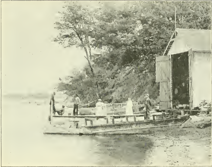
INDIANA UNIVERSITY BIOLOGICAL STATION.