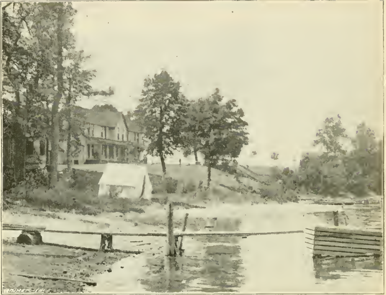
VAWTER PARK HOTEL FROM THE LABORATORY.