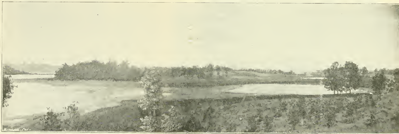
GANS' LAKE. HOOPER'S LAKE. HARTZELL'S LAKE, I.