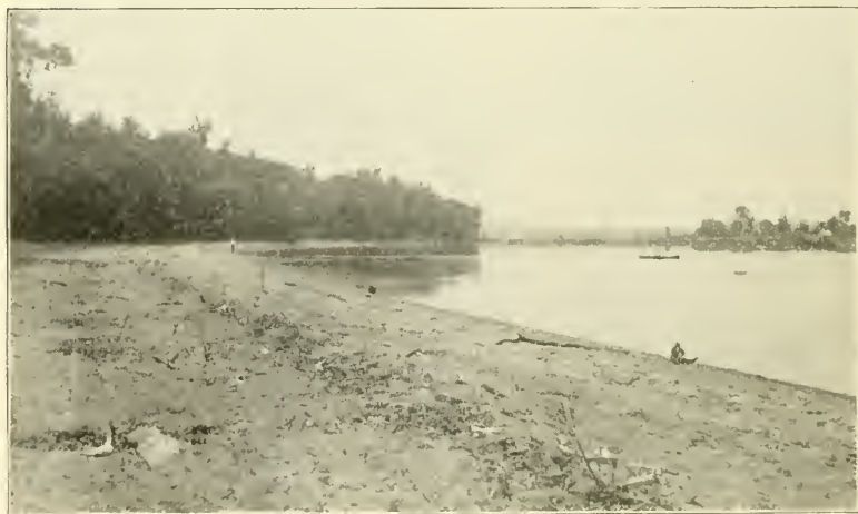
CROW'S BAY SHOWING ICE BEACHES.