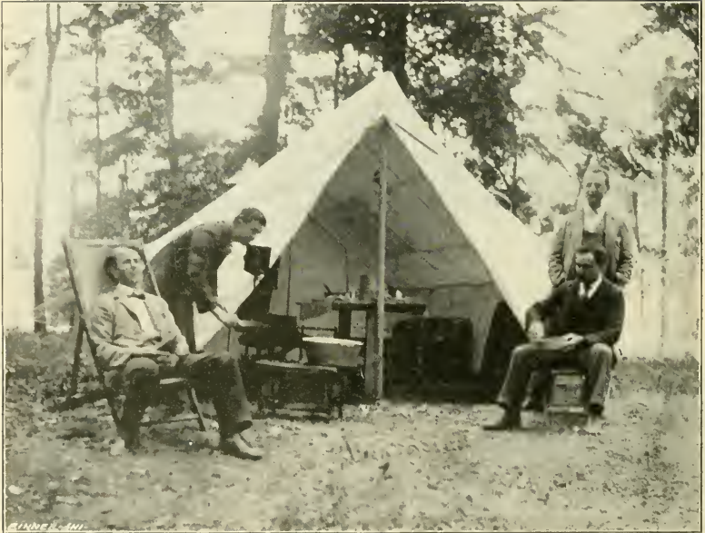
STUDENTS' CAMP IN VAWTER PARK.