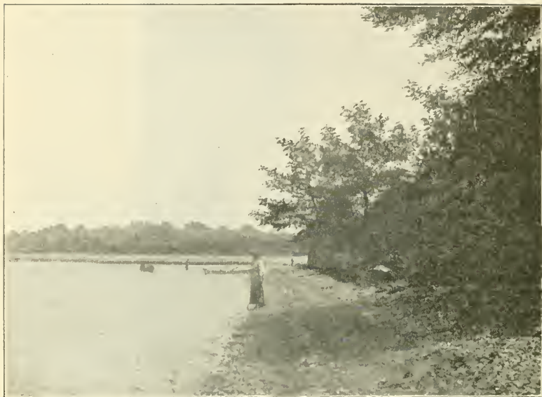
WEST BEACH OF MORRISON'S ISLAND.