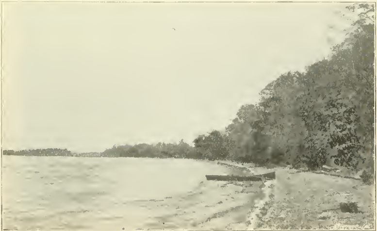
BEACH WEST OF CEDAR POINT.