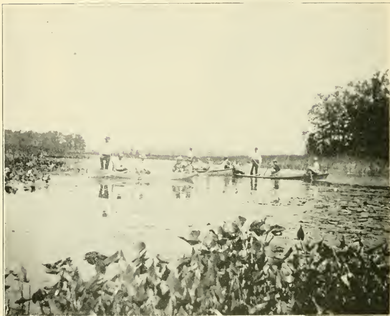
IN THE CHANNEL BETWEEN TURKEY AND SYRACUSE LAKES.