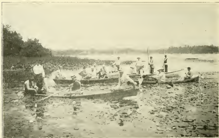
AT THE HEAD OF SYRACUSE LAKE,