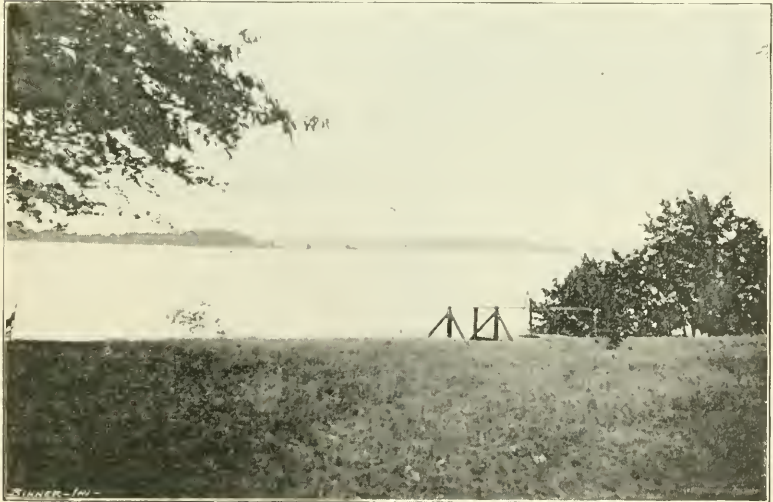
OGDEN POINT FROM NEAR THE POTTAWATOMIE CLUB-HOUSE.