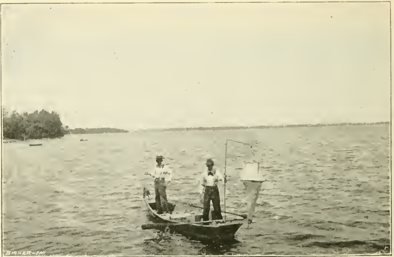
BLACK STUMP POINT FROM THE LABORATORY. PLANKTON BOAT.