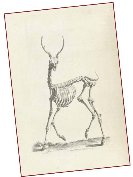
Cover Art:

The image of an deer skeleton above is from William Cheselden's Osteographia, or the anatomy of the bones , published in 1733. For more information and images visit the NLM's Historical Anatomies on the Web . This digital project includes numerous high quality images from the library's important anatomical atlases.