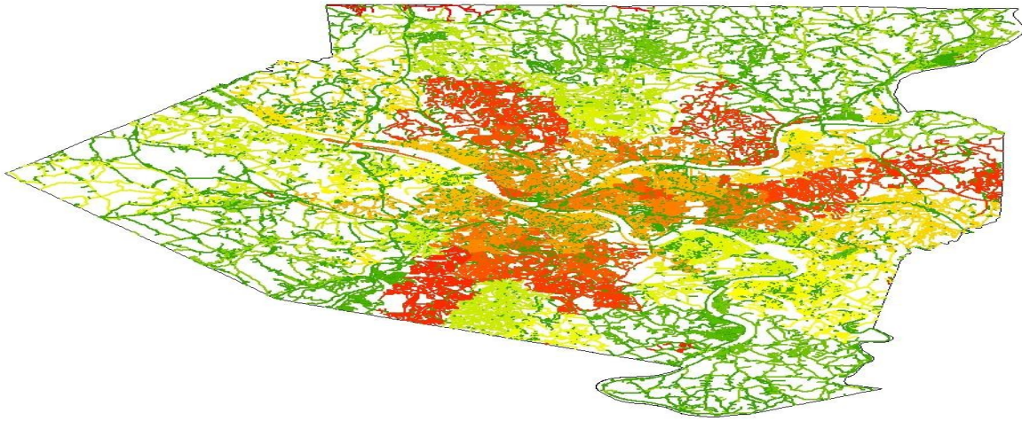
Example 2: ZIP codes in Allegheny County, Pennsylvania.