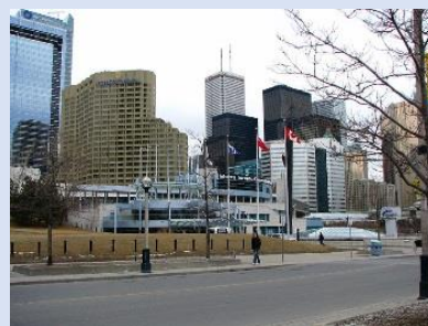
Metro Toronto Convention Centre