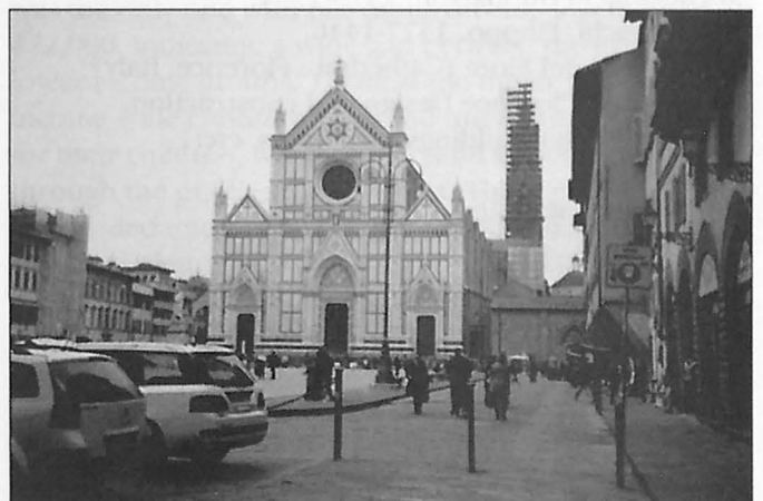
Santa Croce, church in Florence