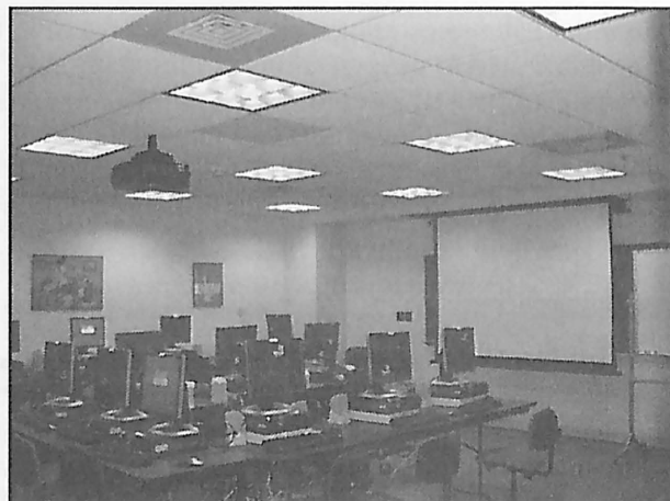
Current photo of Instruction Room, View 1.

IU South Bend has a shortage of available classroom lab space, so the librarians agreed to use the library instruction room as the classroom for the one-credit course. Because the lab had only 22 student workstations, we had to negotiate with IU South Bend's