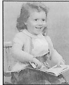
Editor at Age 3