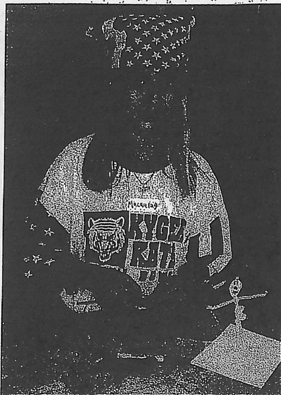
Young lady creating her calavera sculpture in a children's art class from the Hispanic Cultural Arts Festival, September 2004, Frankfort Library.